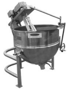
DL-60 INA/2 Model shown