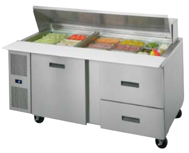
Model PT72-30W-L shown with optional drawers