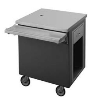
Model RANFG CA shown with RAN INV30 trayslide