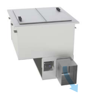
9552-290 back to front airflow shown