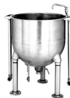
Shown with Optional Pre-Piped Box